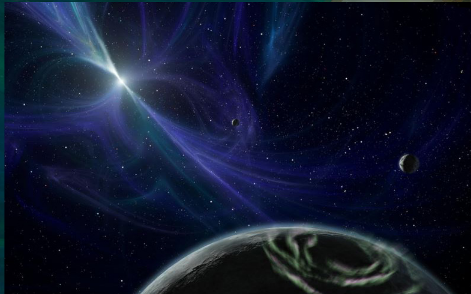
Artist View of Pulsar Planet System.

Pulsars—a type of rotating neutron star—are well-known for their use as incredibly stable astrophysical clocks. Their regularity, used to measure their radio pulses, has led to some of the most exciting tests of Einstein’s general theory of relativity and allowed scientists to examine the behaviour of the extremely dense matter inside neutron stars.