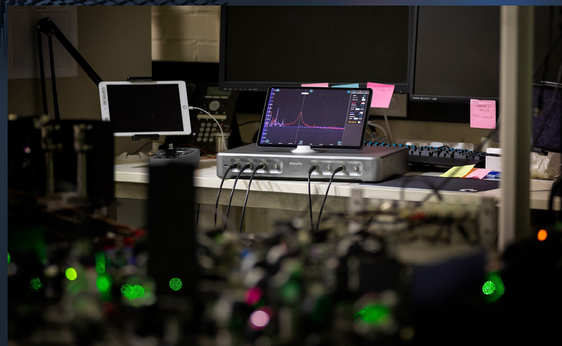
The new Moku:Pro hardware with iPad user interface undergoing testing in the OzGrav lab at ANU.

Daniel Shaddock says: "Moku:Pro takes software defined instrumentation to the next level with more than 10x improvements in many dimensions - it's a new weapon for scientists. Moku:Go takes all the great features of Moku:Lab but reduces the cost by 10x to make it more accessible than ever before. We hope it will help train the next generation of scientists and engineers in universities around the world."