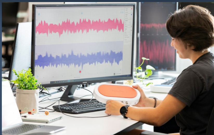
MokuGo: an engineering lab in a backpack

more than $25M USD in Venture Capital investment, and now has more than 1000 users in 30 countries.