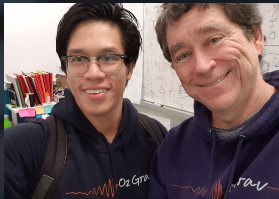
Managed to visit the University of Adelaide OzGrav node between lockdowns last week, albeit briefly!