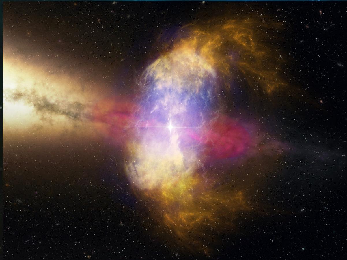
Artist's impression of supernova outflow.