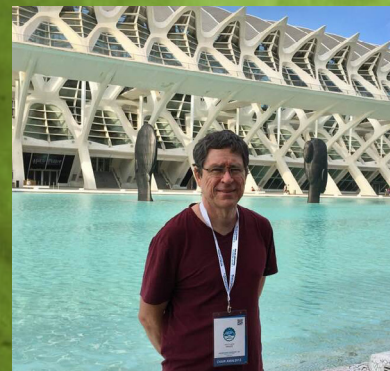
The Director at the 13th Amaldi Conference in Valencia, Spain.